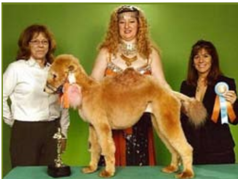
Winner of the Extreme Poodle Grooming Contest. It's a Camel.

RECONSTRUCTION IN WISCONSIN: Traveling to Wisconsin via the Tri-State Tollway (I-94/I-294) this summer? Be aware that the Wisconsin Department of Transportation (WisDOT) launches reconstruction work on I-94 in Wisconsin this month. Traffic heading northbound will be reduced to one lane through the end of the year. Delays are expected.